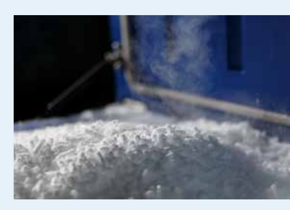
The CIP-5 series exist in 4 models: