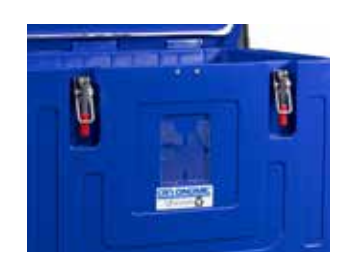
Including document holder