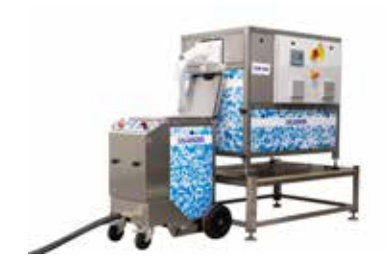
Dry ice blasting machines can directly be filled with dry ice