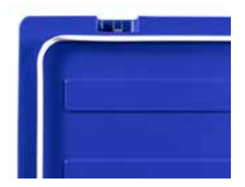
Hygienic silicone seal