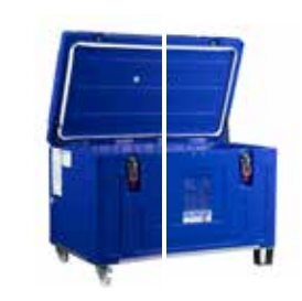
Exchangeable steel feet or 4 pivoting wheels (2 bracked)